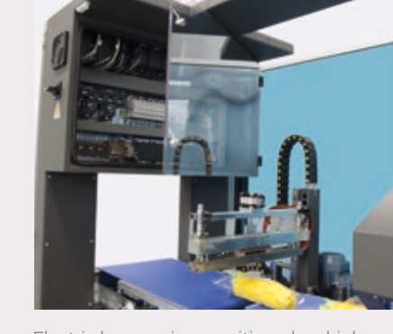
perfectly accessible for the operator.