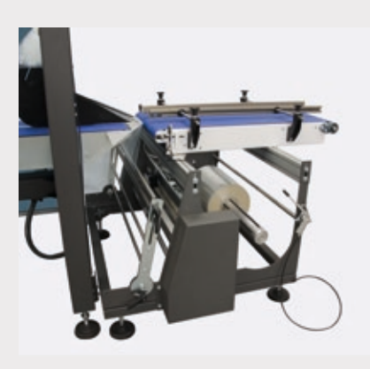
Film dispenser unit with single or double film rolls with joined seal bar for fast film change.