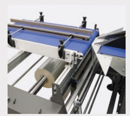
Loading belt to recognise and load the products with conveyors, palettes or cups or directly joined to the previous line.