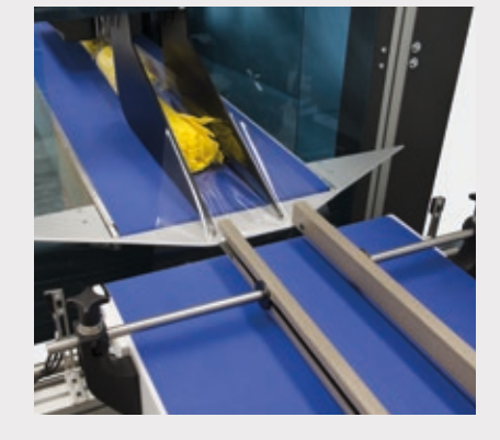
Motorised eletrical adjustable forming inverted head.