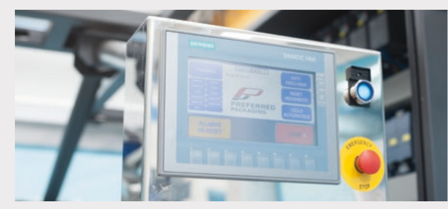
Intuitive touch screen for simple format change. The touch screen can rotate in 3 different Electric box on view, positioned up high, positions to allow the operator to work on all sides of the machine, front, back and side.